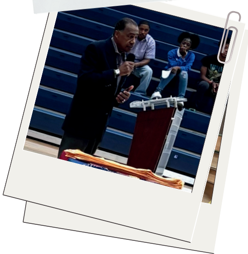
Scholarship Award Celebration Images