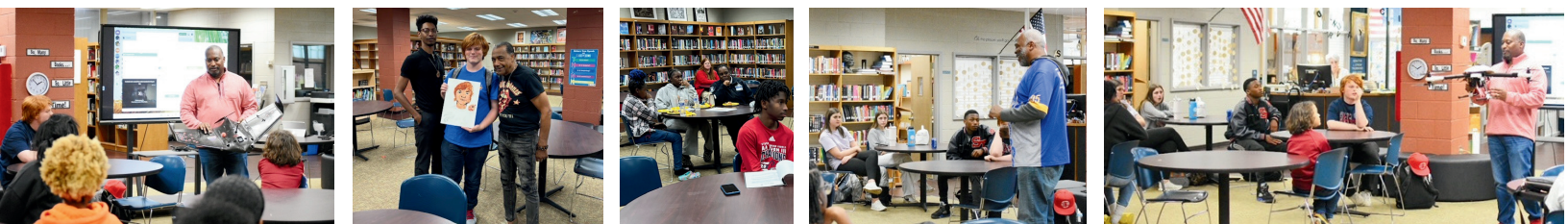
Back-To-School Workshop Images

The Springs Foundation hosted two Back-To-School Workshops in January and August for all of its scholarship recipients (and their parents), going to college for the first time or returning to college. Workshops topics included Transitioning from High School to College: Study Habits and Time Management, and Things You Need to Know About Your College/University: Roles of College/University Administrators and the Importance of Understanding GPA.