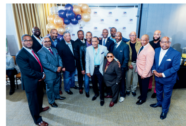
Initial Fundraising Event Images