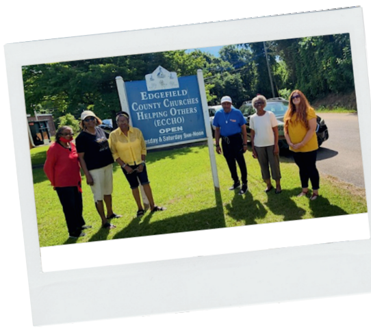
Project Smart Images